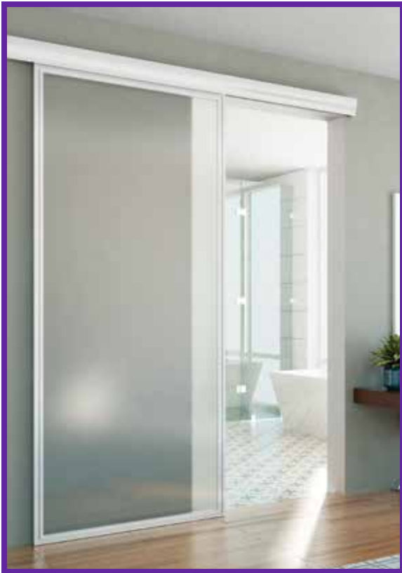
Pictured in a Satin Clear finish with Mystique™ Duratuf® tempered safety glass