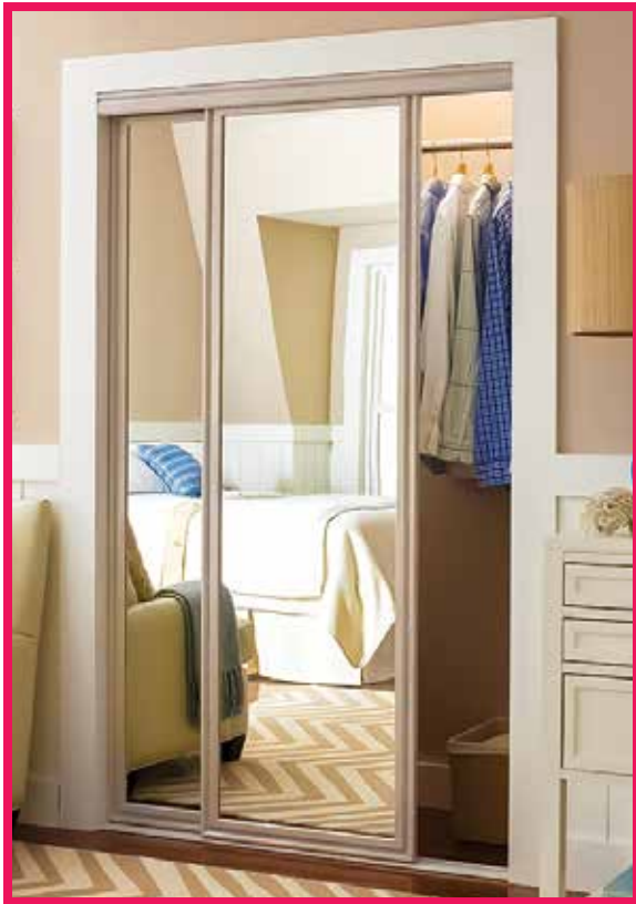
Pictured in a Whitewash Stain finish with Duraflect® copper-free mirror