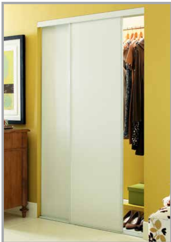
Pictured in a Gloss White finish with White hardboard