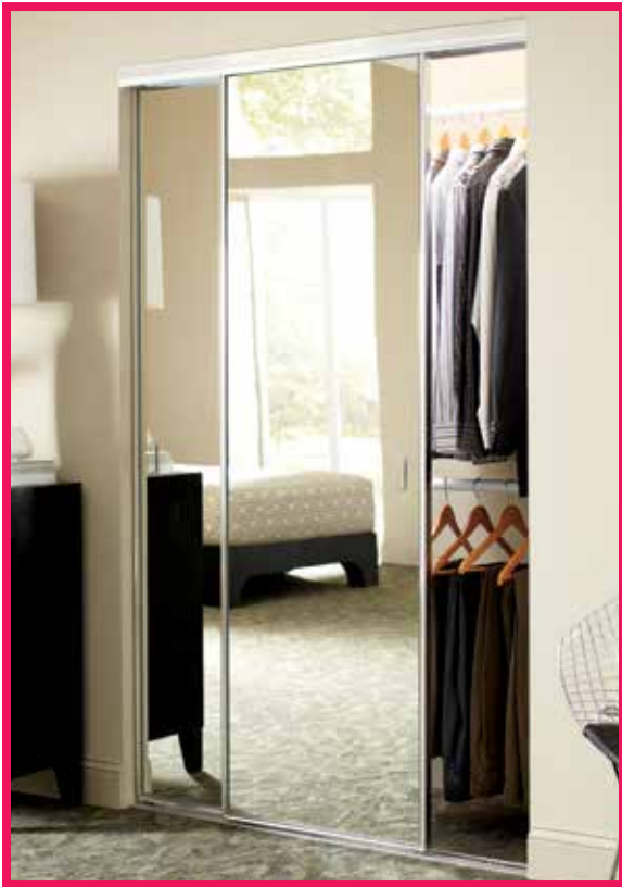
Pictured in a Bright Clear finish with Duraflect® copper-free mirror