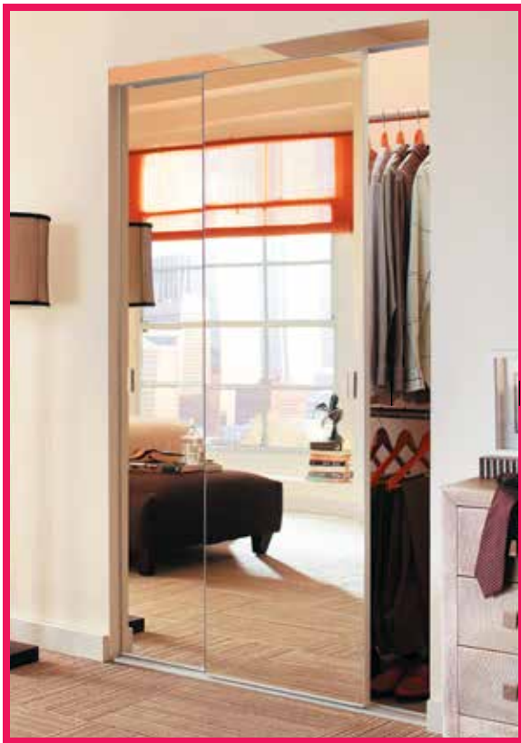
Pictured in a Gloss White finish with Duraflect® copper-free mirror