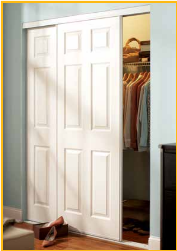
Pictured in a Gloss White finish with a raised 6 panel White hardboard