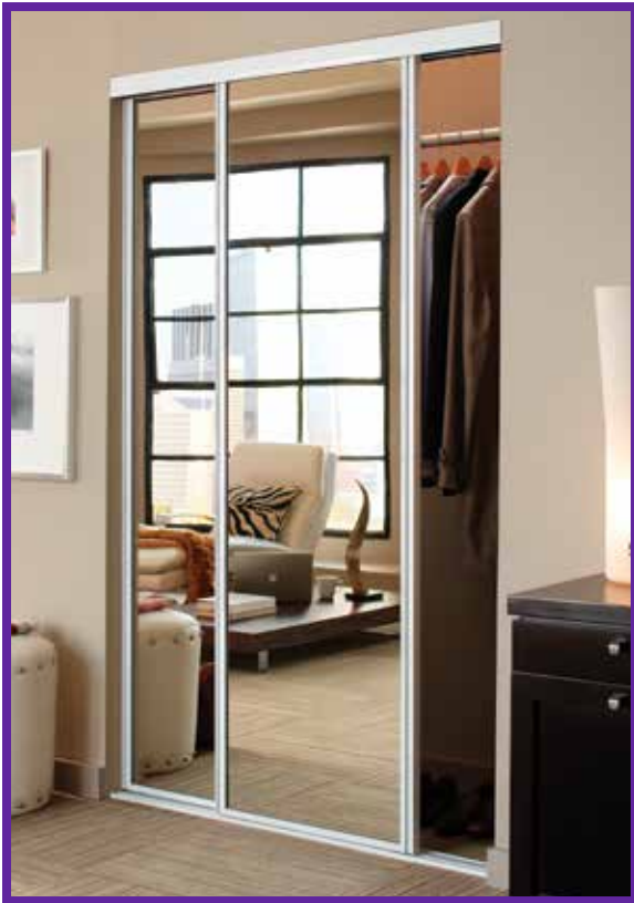
Pictured in a White finish with Duralect® copper-free mirror