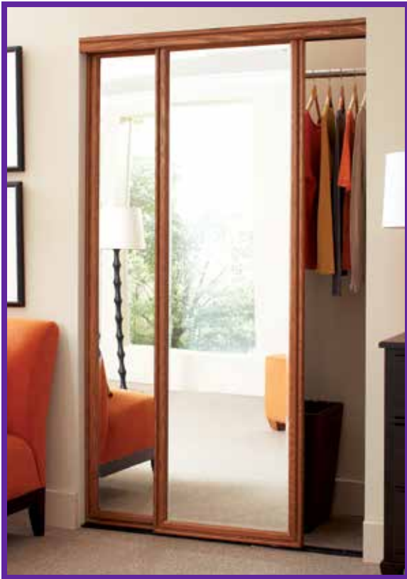
Pictured in a Medium Stain finish with Duraflect® copper-free mirror