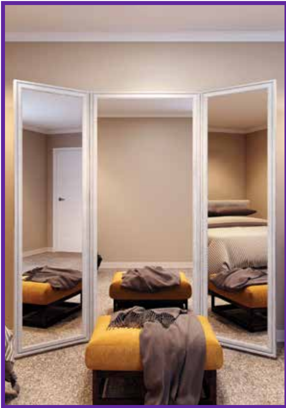
Pictured in a Whitewash Stain finish with Durafect® copper-free mirror