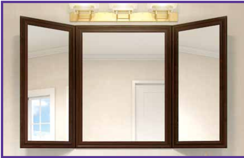
Pictured in a Dark Stain finish with Durafect® copper-free mirror