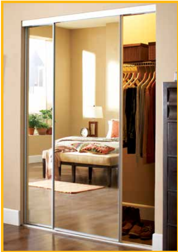
Pictured in a Satin Clear finish with Duraflect® copper-free mirror