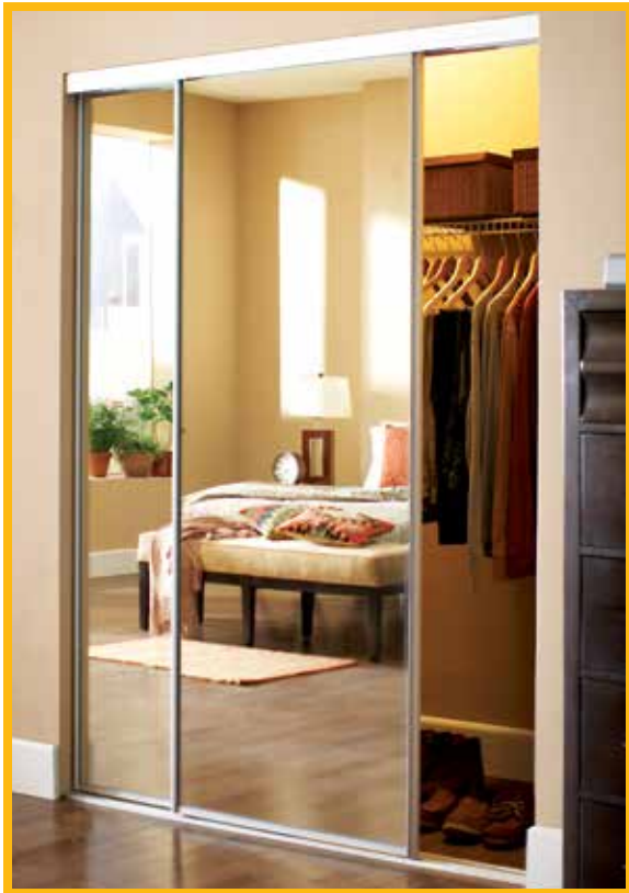
Pictured in a Satin Clear finish with Duraflect® copper-free mirror