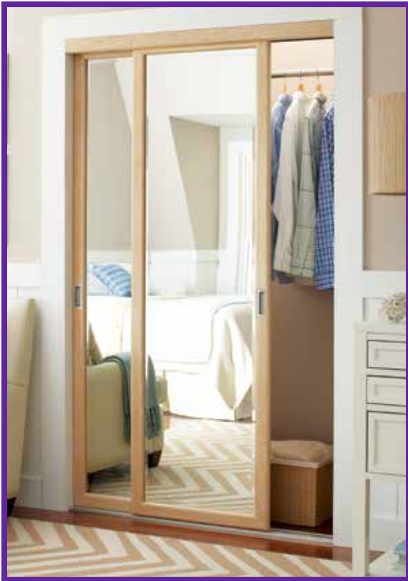
Pictured in a Clear Acrylic Sealer finish with a Duraflect® copper-free mirror