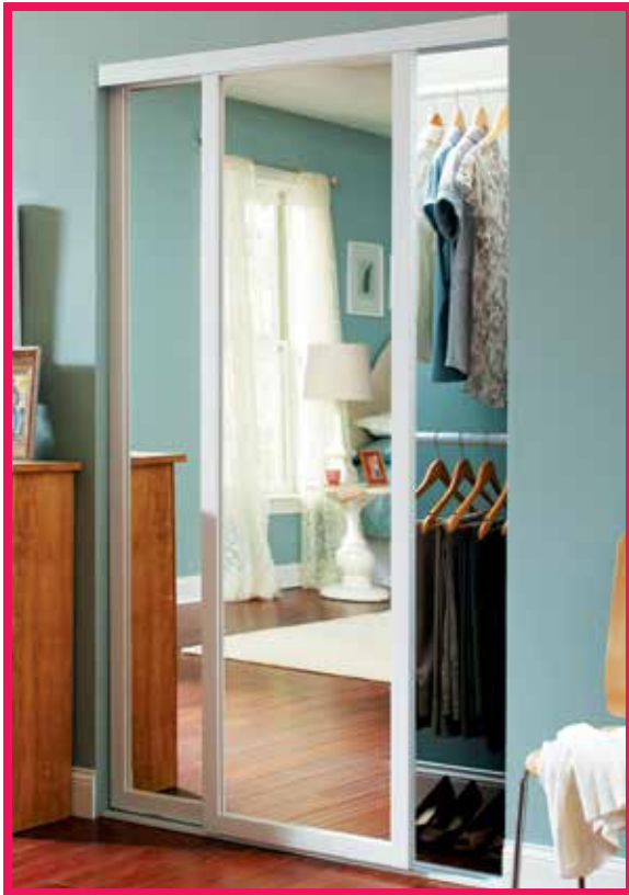
Pictured in a White (Gloss) finish with Duraflect® copper-free mirror