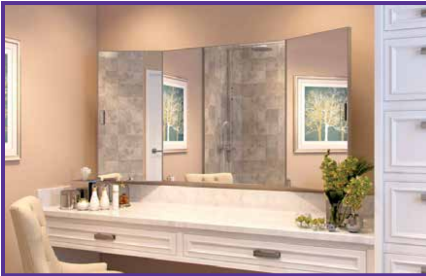
Pictured in a Brushed Nickel finish with Duralect ® copper-free mirror