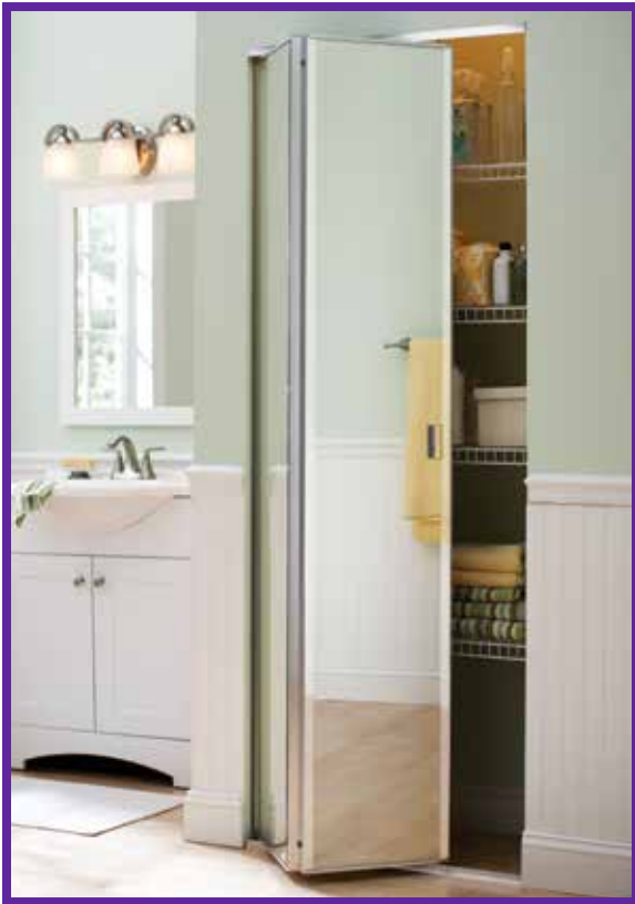
Pictured in a Bright Clear finish with Duraflect® copper-free mirror