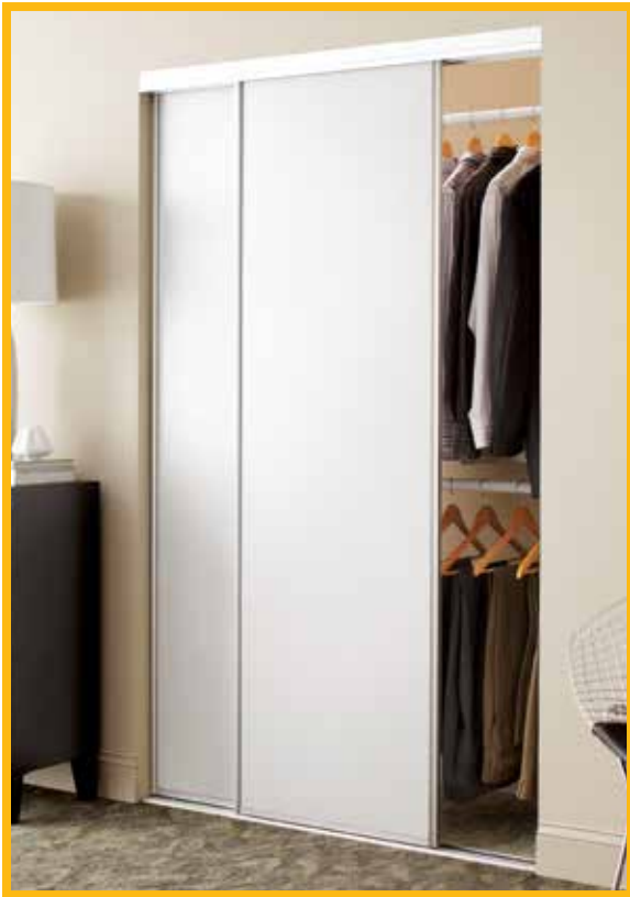
Pictured in a White finish with White hardboard