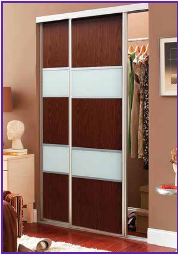
Pictured in a Satin Clear finish with Walnut wood grain inserts and Snow White back painted glass inserts