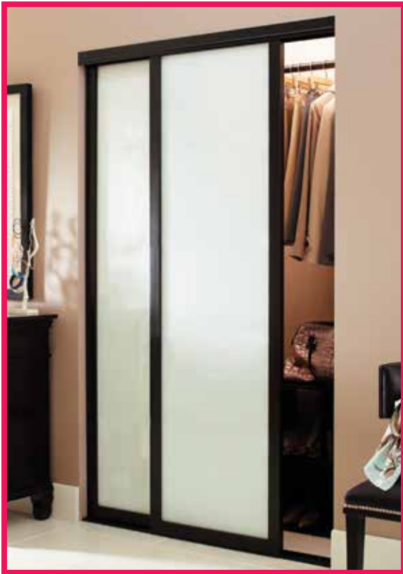
Pictured in an Espresso finish with Snow White back painted glass