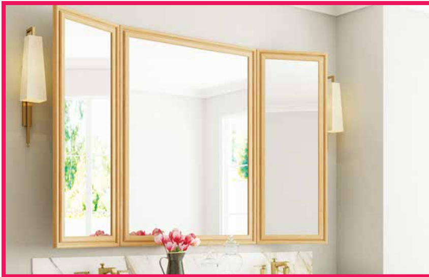
Pictured in a Clear Acrylic Sealer finish with a Duraflect® copper-free mirror