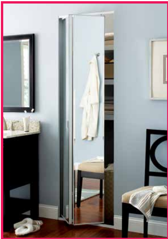
Pictured in a Gloss White finish with Duralect® copper-free mirror