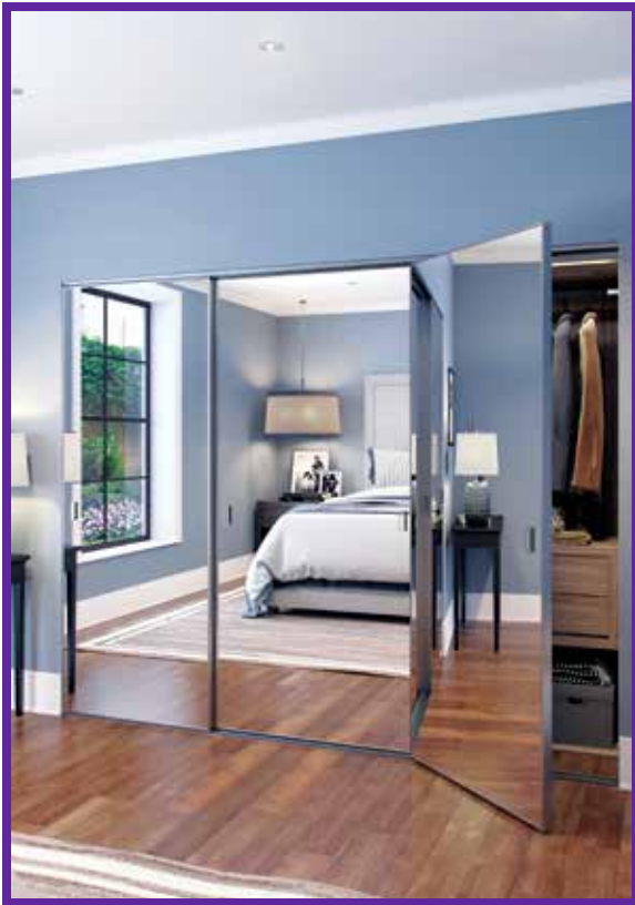
Pictured in a Bright Clear finish with Duraflect® copper-free mirror