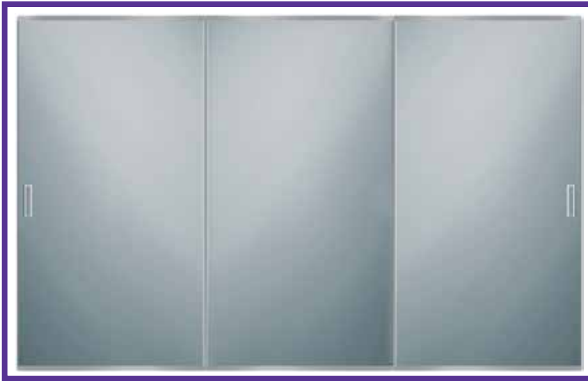
Pictured in a Satin Clear finish with Duraflect ® copper-free mirror insert